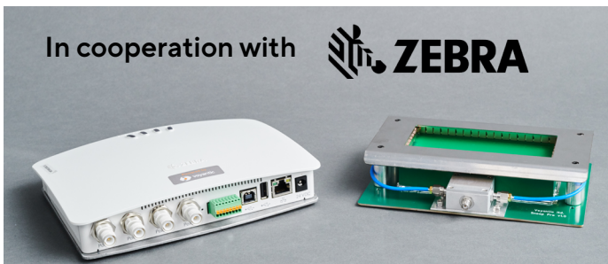
RAIN RFID Encoder (Zebra FX7500, customized)