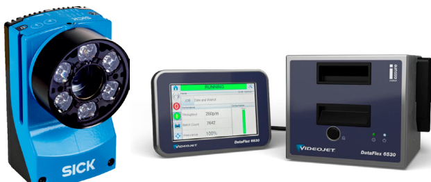
1D/2D code reading, variable data printing